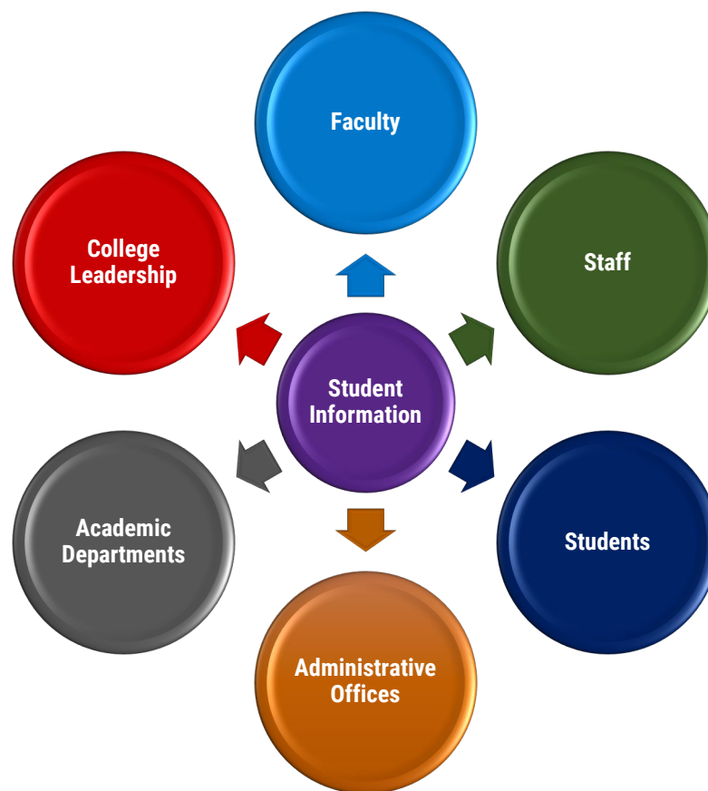
Figure 2: Internal Constituents

OIRE provides data to internal constituents to support a variety of data needs (Figure 2). In general, OIRE produces annual reports, provides data to support accreditation, supports the data asset management team’s agenda, and assists with survey and focus group question design. Internal data needs involve the extraction and production of a wide range of data to inform the College on student demographics and performance metrics, as well as specific departmental and faculty data needs that help make informed decisions in support of institutional effectiveness. OIRE produces the Academic Tool Kit, a fall semester student enrollment profile, data for the Student Success Score Card and MC by the Numbers, the Performance Accountability Report, and makes available a wide variety of data and reports on the OIRE website . The compilation of data can range from simplistic enrollment data extracts to analyses and projections that are more complex.