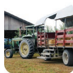
Farms and Ranches