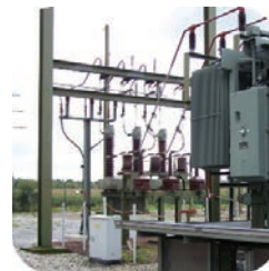
Power Transmission and Distribution